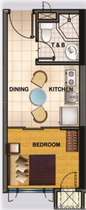
1-BEDROOM UNIT Approx. 22.16 sqm