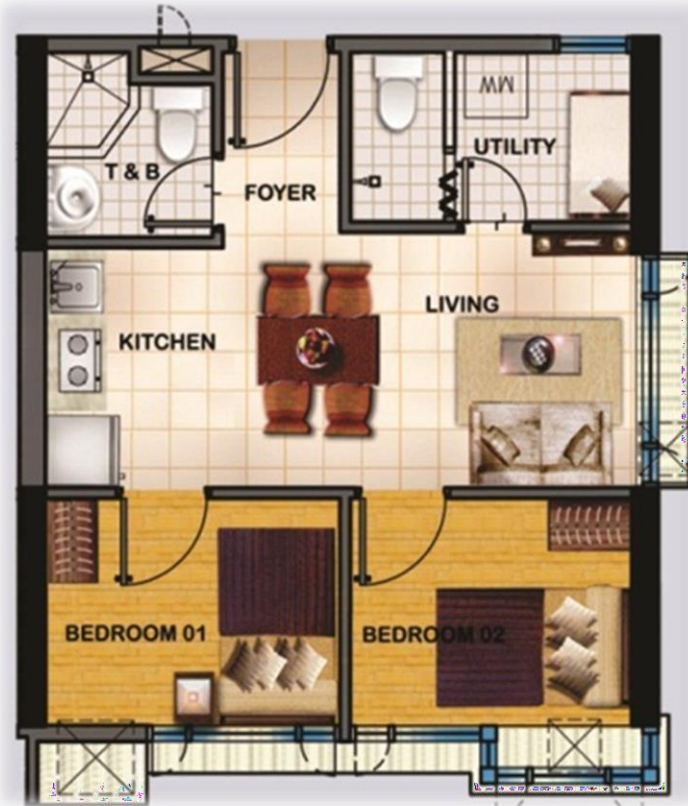
2-BEDROOM UNIT Approx. 43.13 sqm