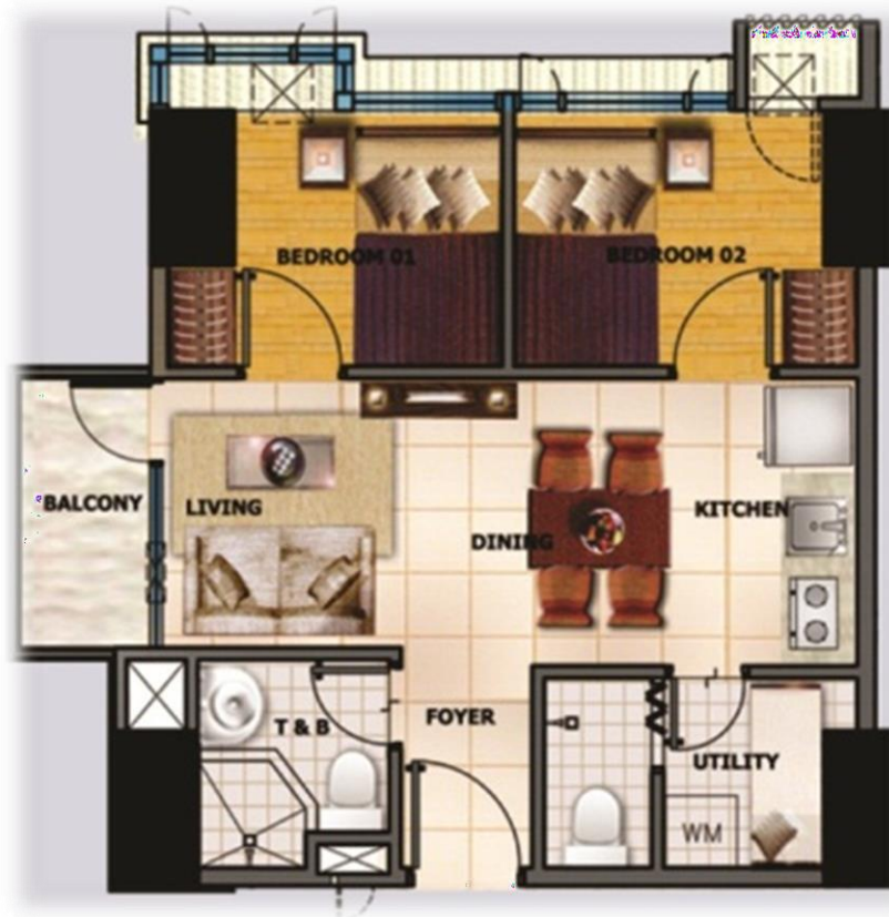
2-BEDROOM UNIT w/ BALCONY Approx. 66.31 sqm